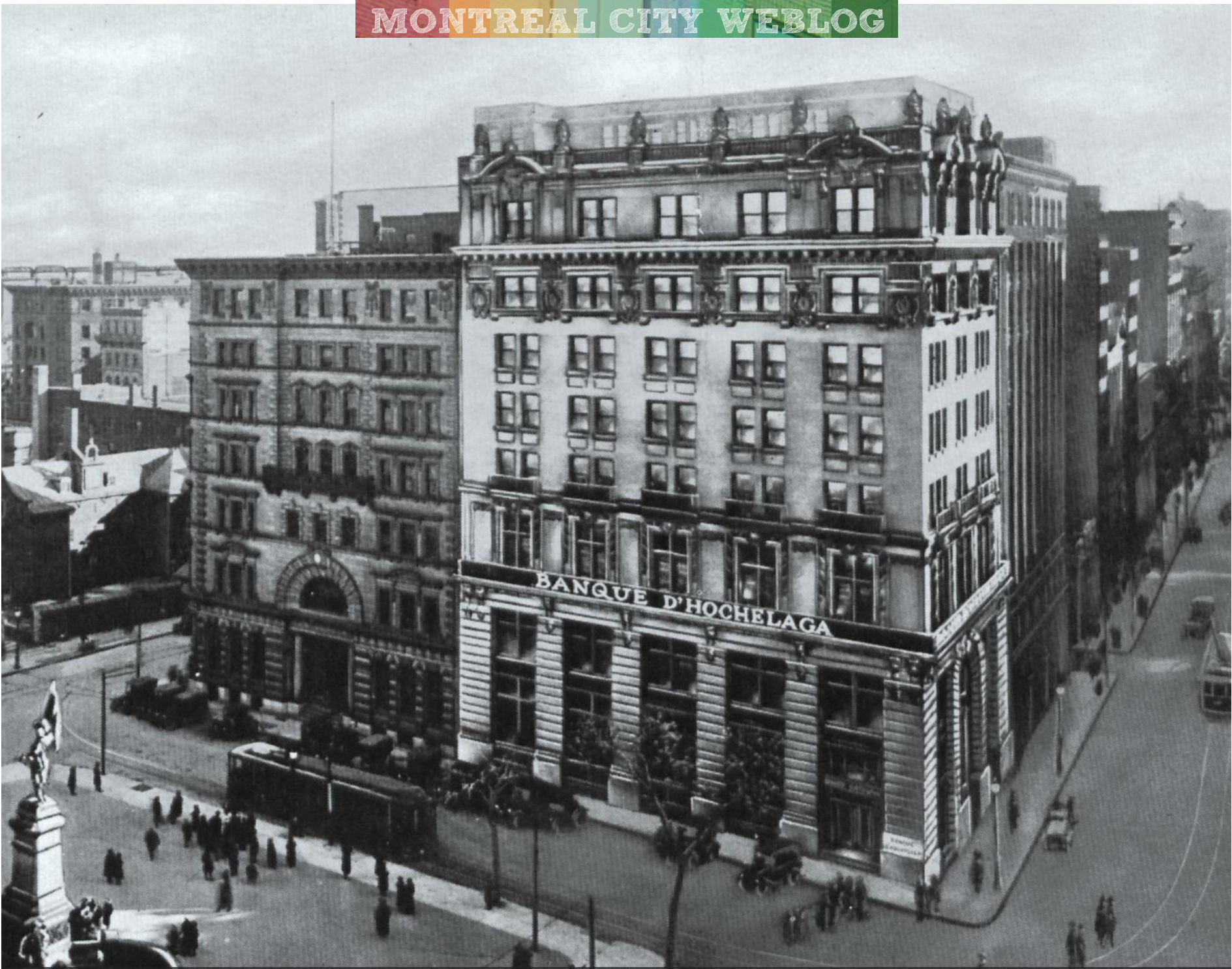
Bank of Hochelaga, Place d'Armes, 1922