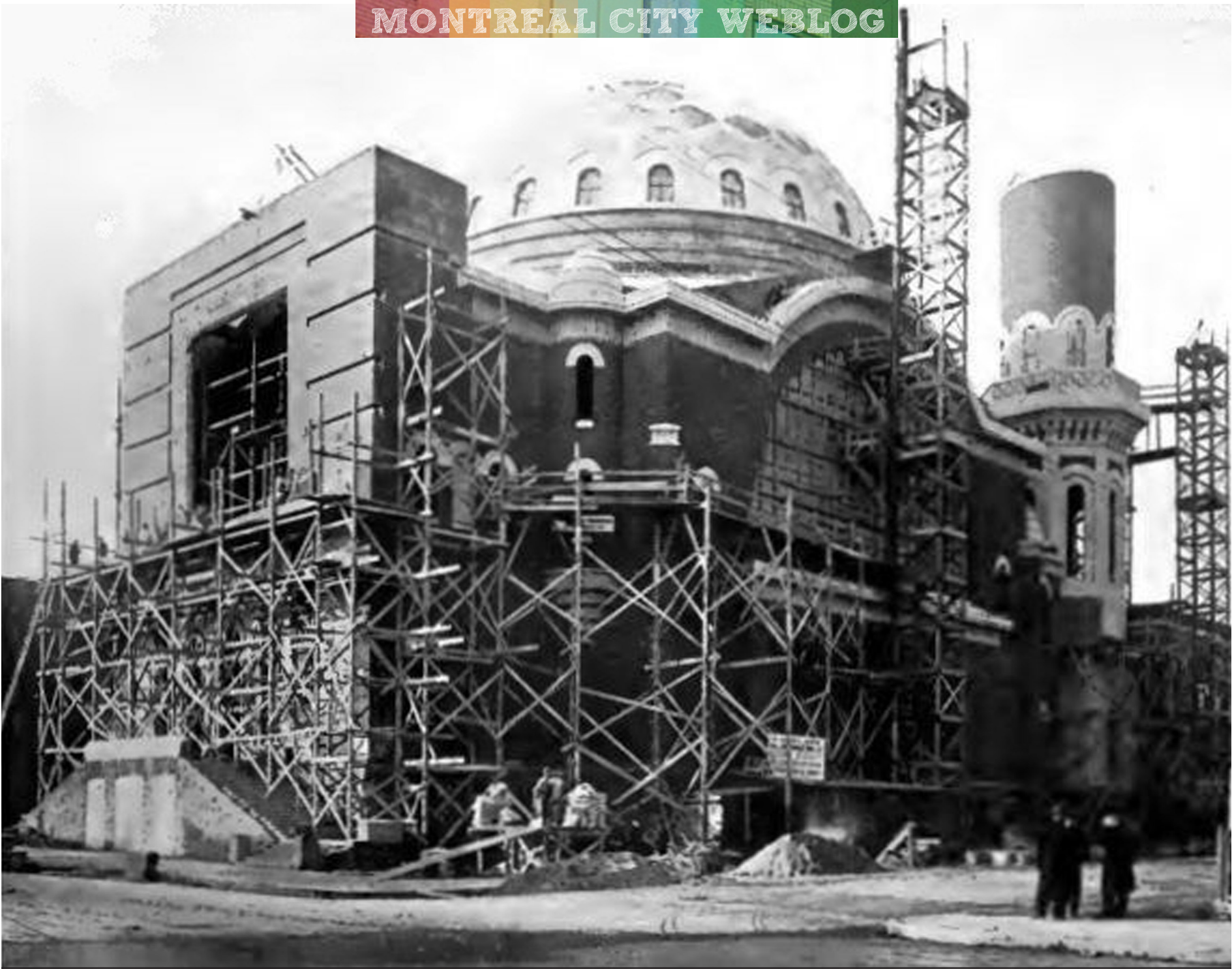
St Michael's under construction in 1916