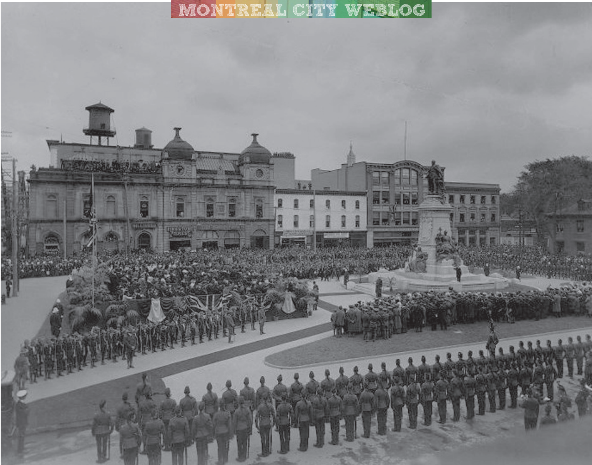
Phillips Square, 1914