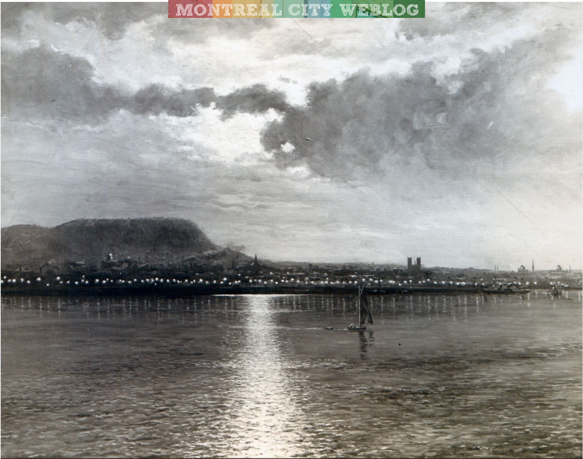
Montreal by moonlight, 1902