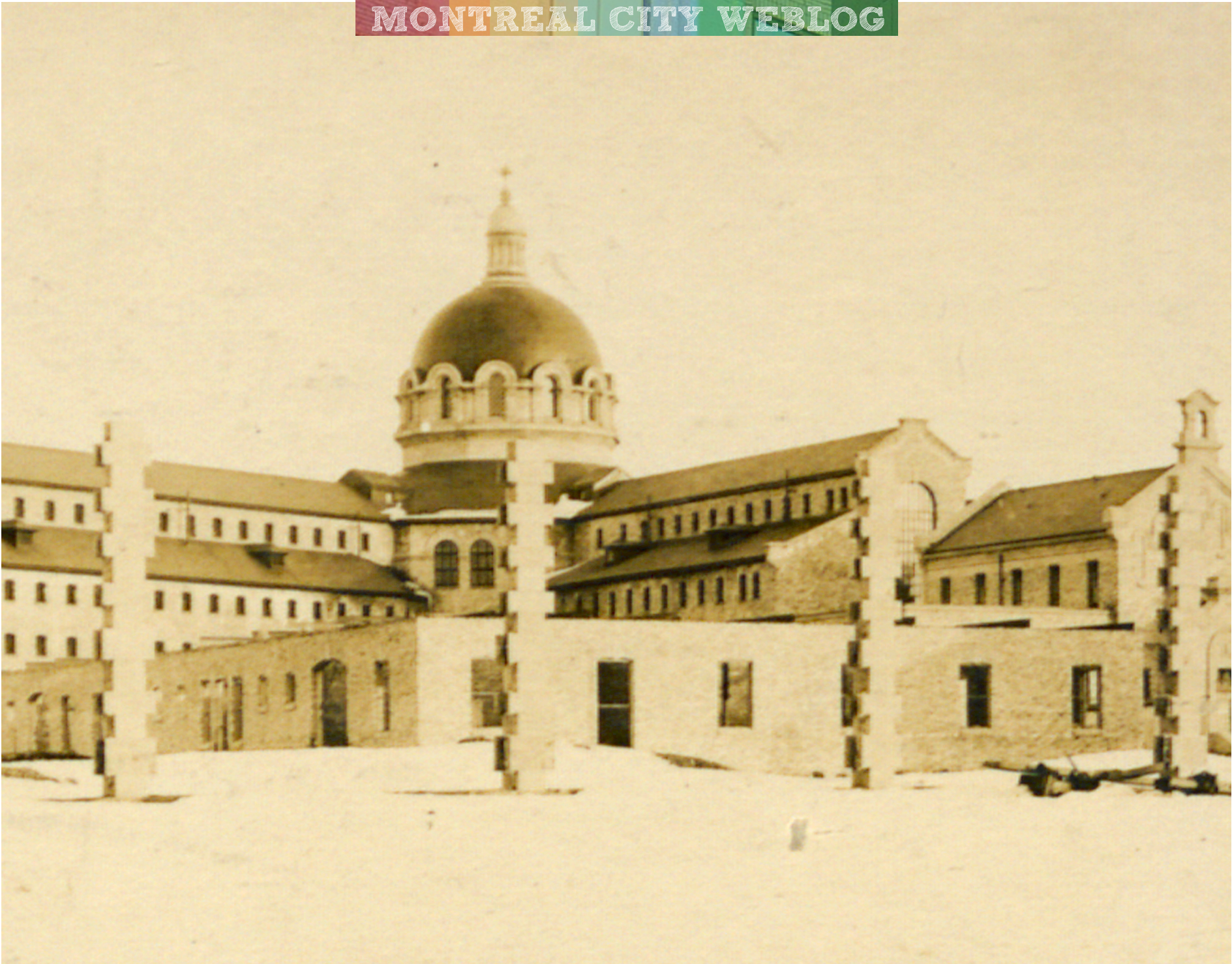
Bordeaux jail, 1912