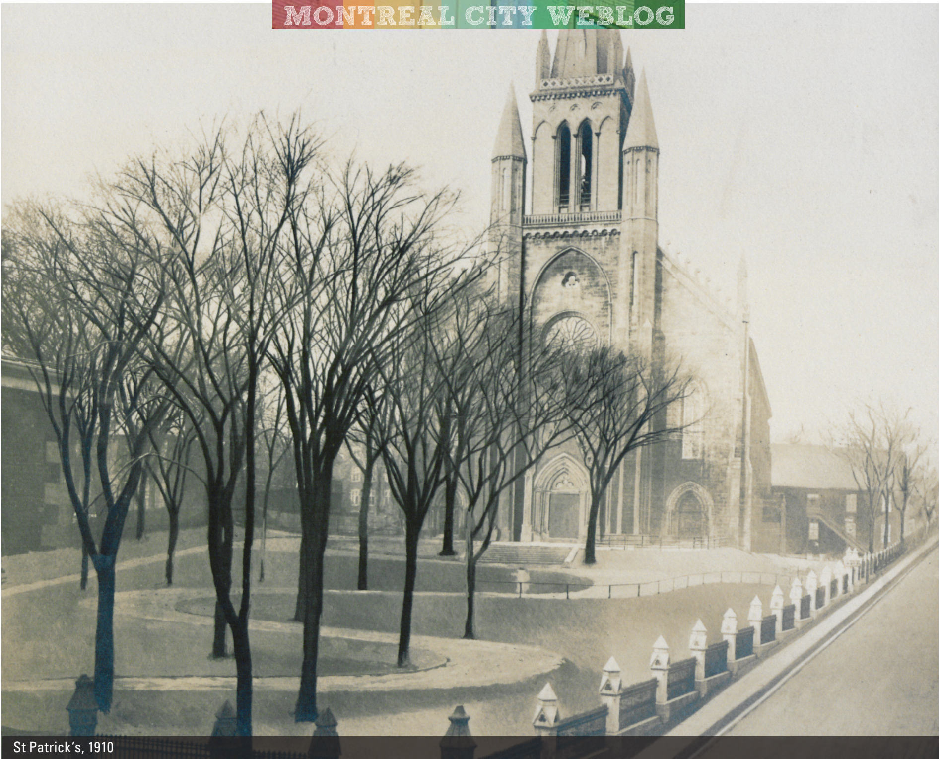
St Patrick's, 1910