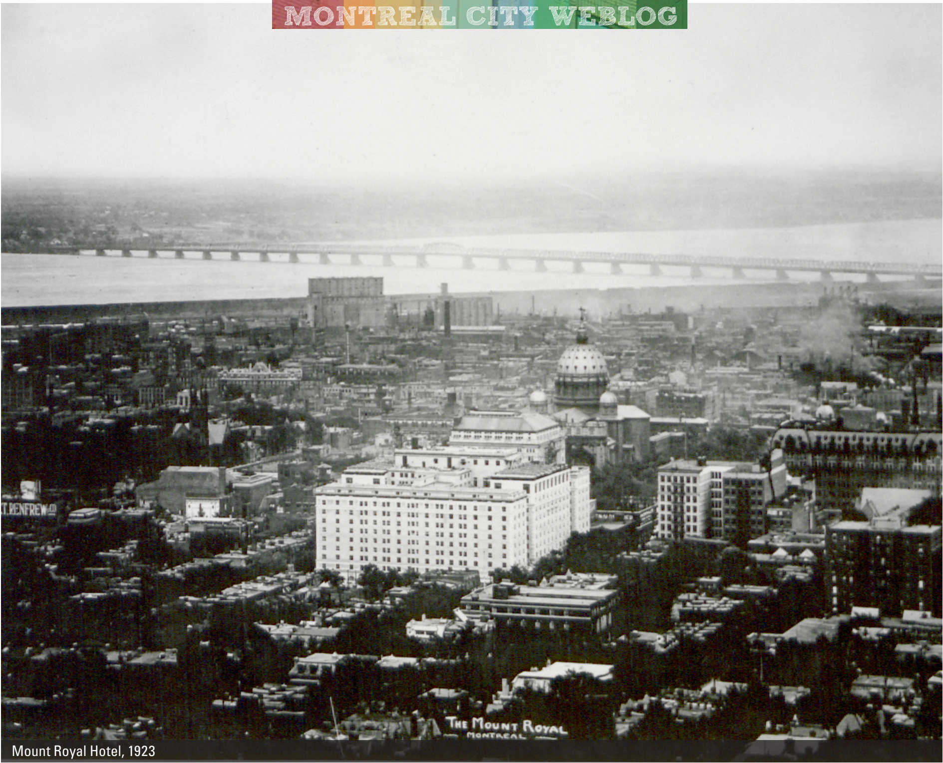
Mount Royal Hotel, 1923