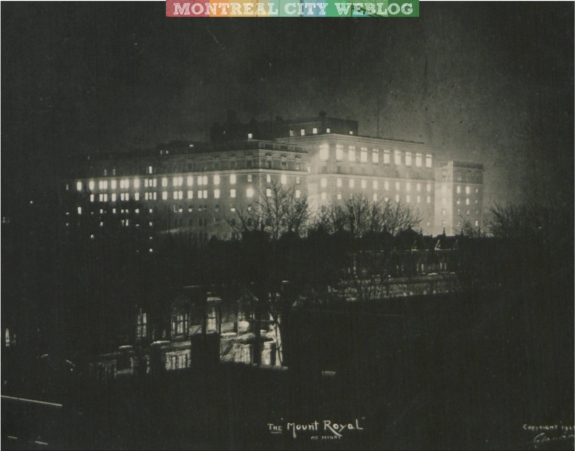
Mount Royal Hotel at night, 1923