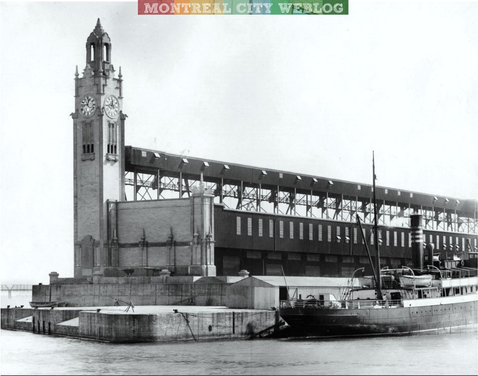
Clock tower, 1922