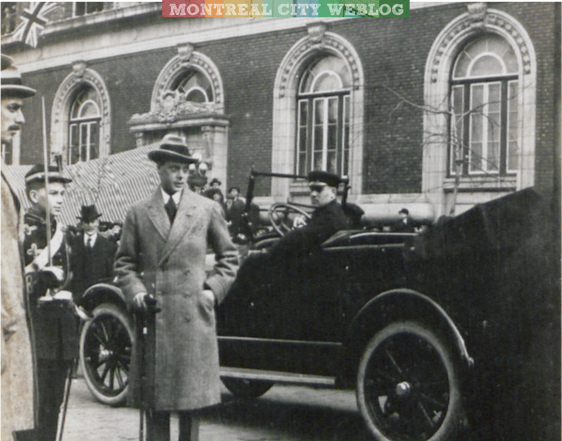
Edward Prince of Wales on Cherrier Street, 1919