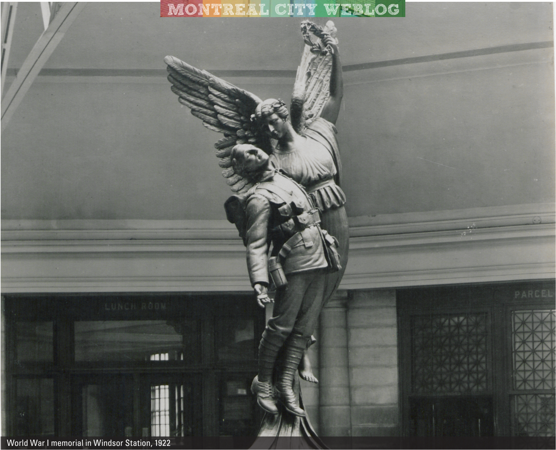
World War I memorial in Windsor Station, 1922