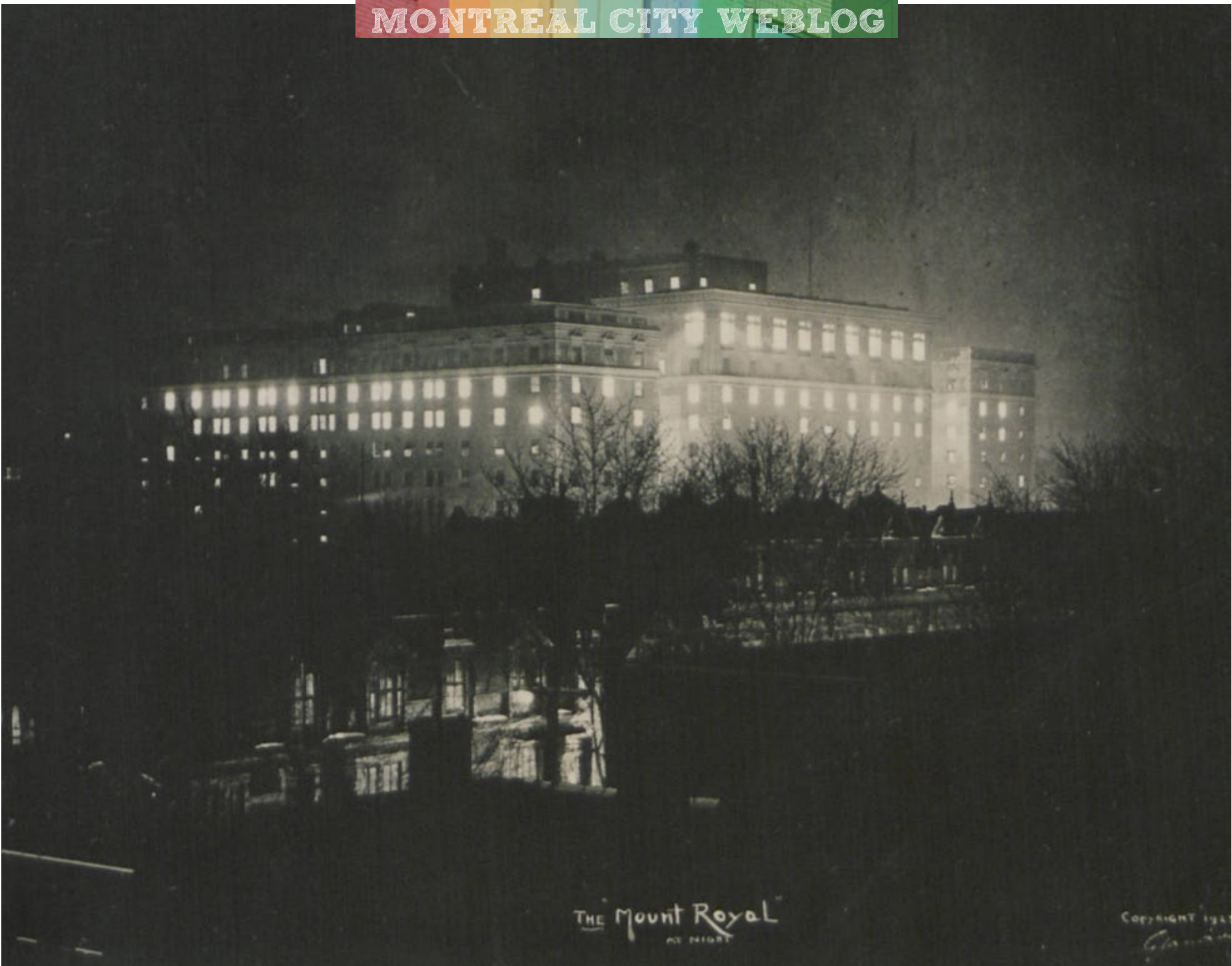
Mount Royal Hotel at night, 1923