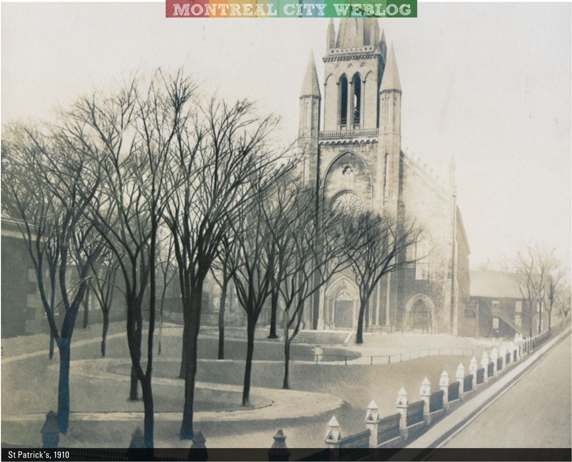
St Patrick’s, 1910