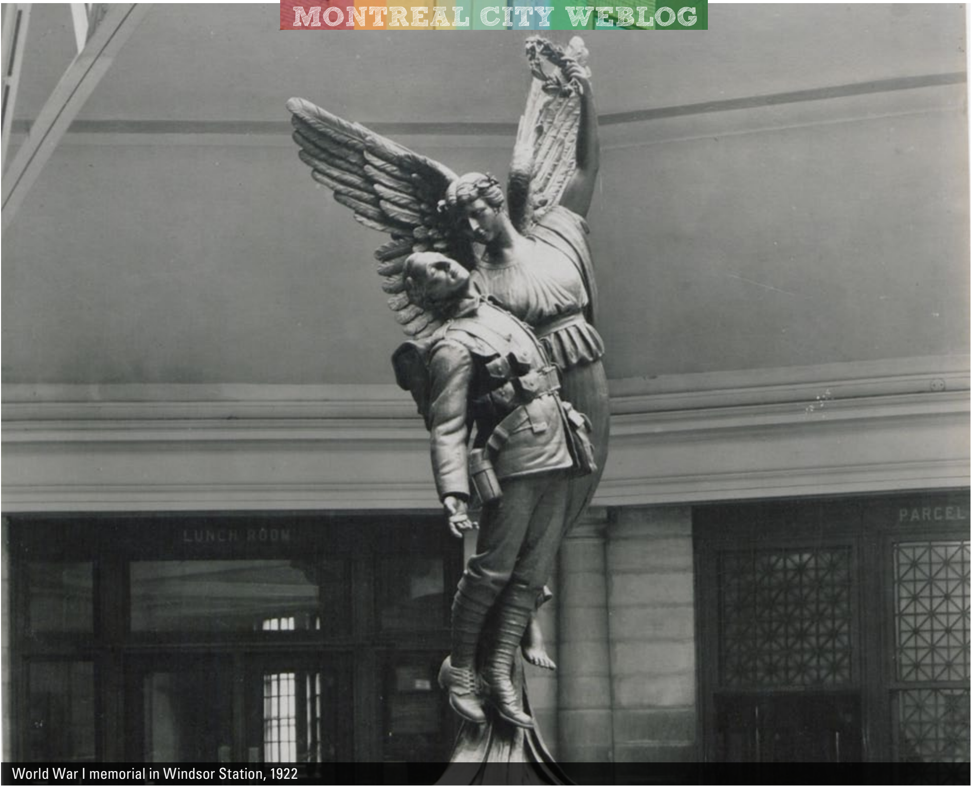
World War I memorial in Windsor Station, 1922