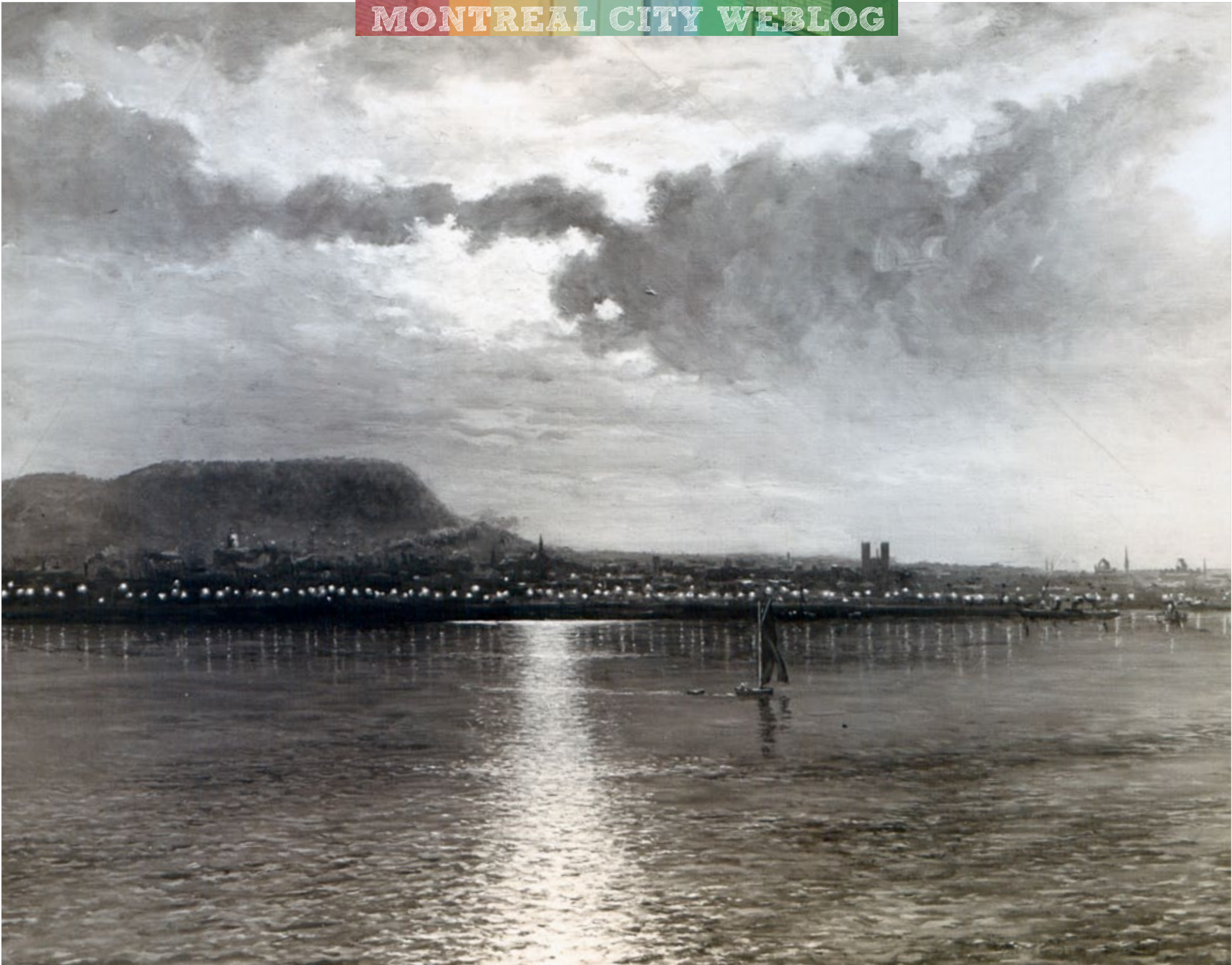
Montreal by moonlight, 1902