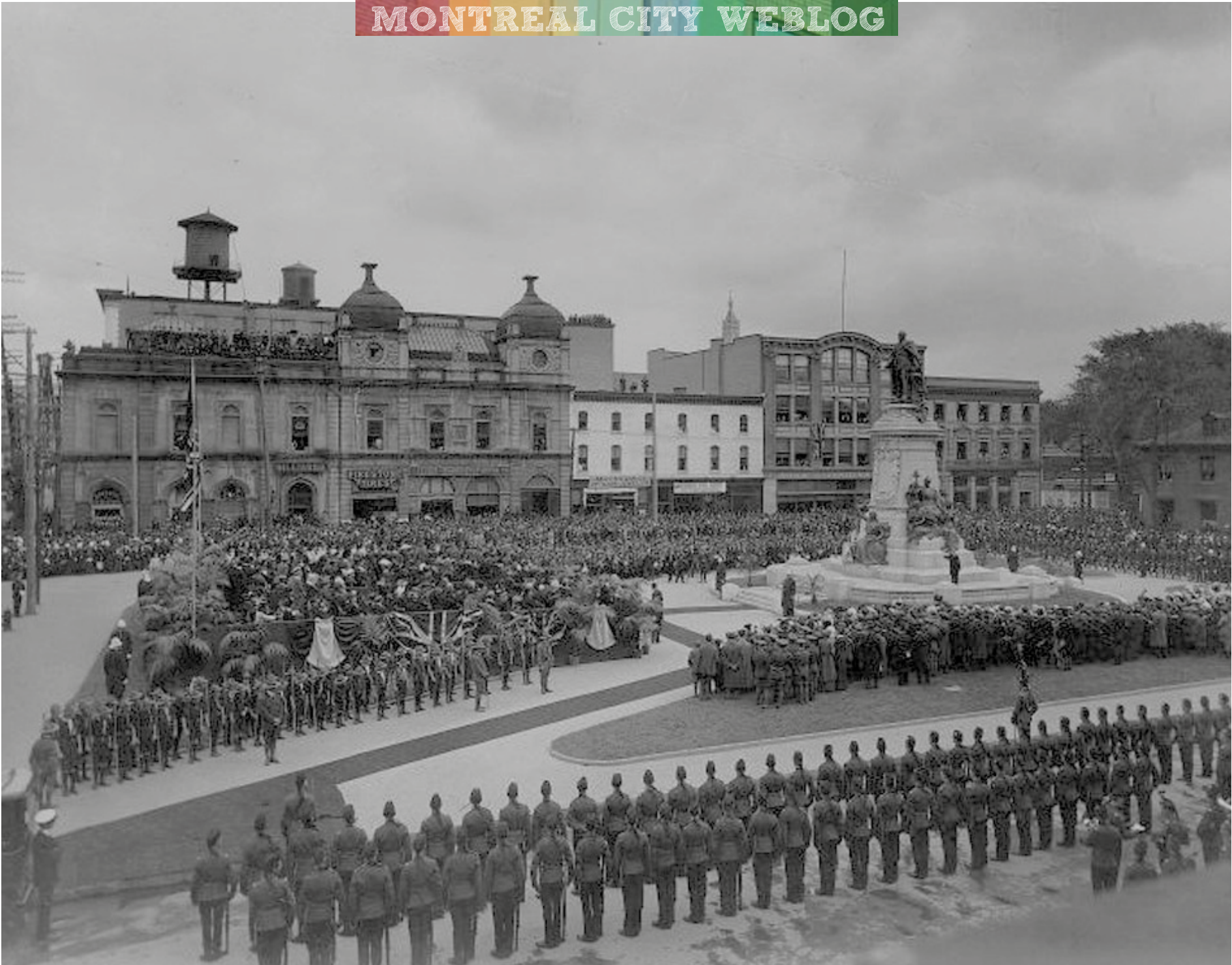
Phillips Square, 1914